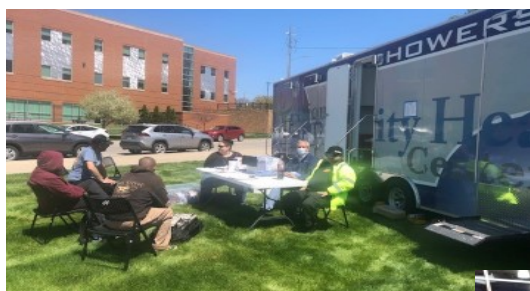
Warming Shelter Showers

We have been hard at work helping our neighbors. Thanks to the generosity of our donors, we've served as the fiscal agent for the Siouxland Recovery Fund, and worked with ten local emergency management professionals to distribute food to those in need, help essential workers find daycare, provide hope and comfort to the lonely and so much more. Now more than ever United Way is working to unite the caring power of our community.