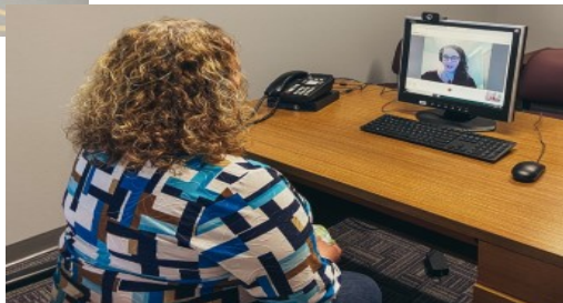
Siouxland Mental Health