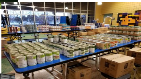
Girls Inc. Family Food Drive