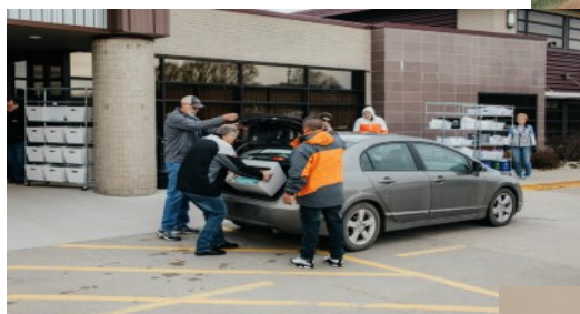
Sunnybrook Hope Center