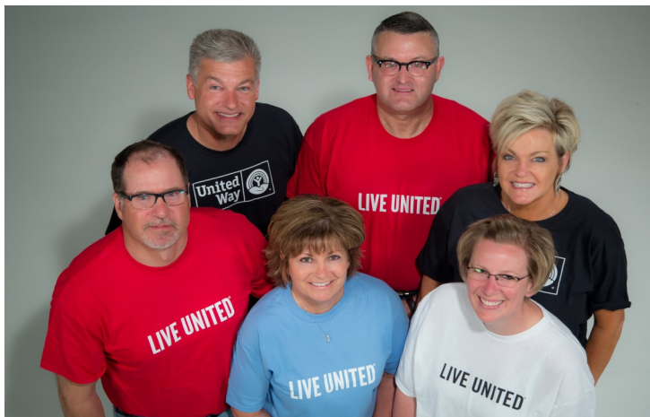
2019-2020 Campaign Chairs